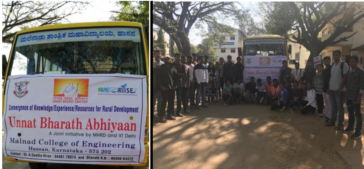
Team proceeding towards House hold village survey

Overall, the survey proved to be very fruitful as the entire team was able to facilitate the various initiatives of GoI to the villagers which would benefit them in many ways.